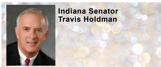
Indiana Senator Travis Holdman

On the public policy front, we took a hard look at incorporation by reference and its effect on the powers of