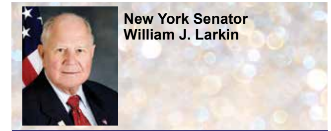
New York Senator William J. Larkin

Senator Larkin served for over 40 years in the New York State Legislature, having served in the Assembly from 1979-