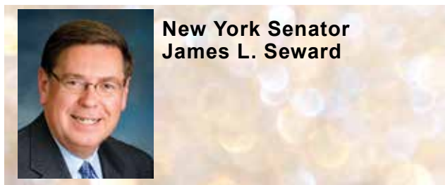
New York Senator James L. Seward

This was also a time for NCOIL to continue to promote state-based modernization efforts regarding speed-to-market, market conduct, and producer licensing. Another key focus was the use of education and occupation in underwriting personal lines insurance, credit default swap regulation, crop insurance adjuster licensing, and healthcare reform strategies.